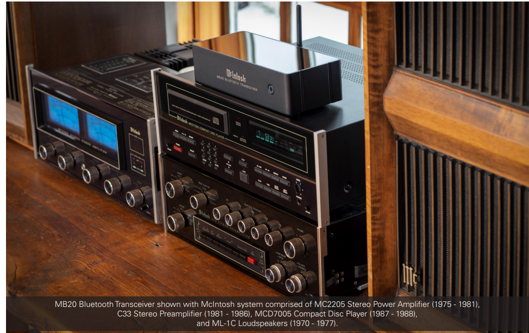
MB20 Bluetooth Transceiver shown with McIntosh system comprised of MC2205 Stereo Power Amplifier (1975 - 1981), C33 Stereo Preamplifier (1981 - 1986), MCD7005 Compact Disc Player (1987 - 1988), and ML-1C Loudspeakers (1970 - 1977).